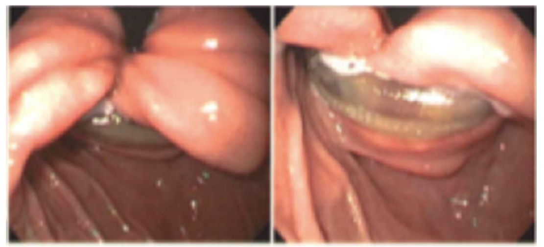
Figure 1. Endoscopic view showing gastric wall erosion secondary to gastric band device.

The diagnosis of a LASGB-related complication is facilitated by ancillary studies including upper gastrointestinal contrast series, computed tomography scan, and upper endoscopy, the later providing the highest sensitivity of all [2, 3, 13]. A pathognomonic finding in an upper gastrointestinal contrast study is visualization of the band as an intraluminal-filling defect. Nevertheless, this finding only occurs when at least 50% of the band has already migrated into the gastric cavity. An upper endoscopy with a retroflexed view allows direct visualization potentially eroded segments just below the gastroesophageal junction. Endoscopically, the erosion can be classified in 3 stages: Stage 1: a small part of the band is visible through a mucosal defect; Stage 2: more than half of the band has migrated in to the gastric cavity; and Stage 3: complete intragastric migration of the band. An upper GI endoscopy was routinely performed in all of our patients and demonstrated that the silicone band had perforated the stomach in three patients (Figures 1).